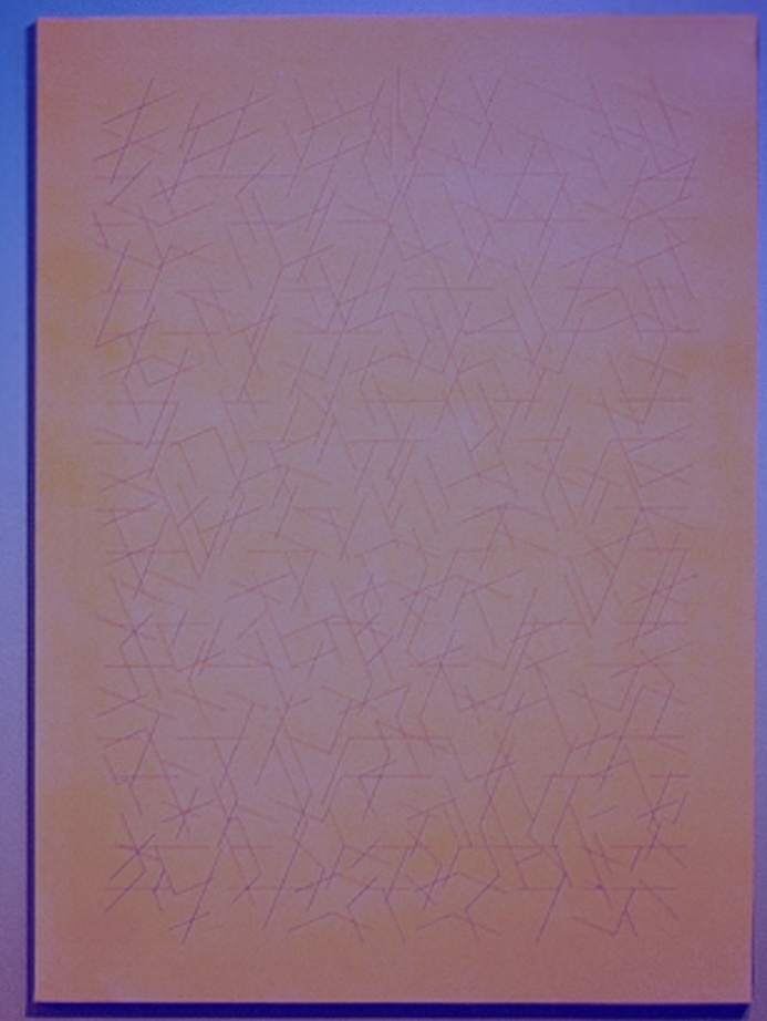
ERNESTO VENTÓS Limon (2018)