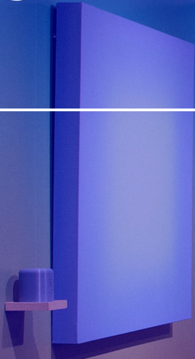
CARLOS JOSÉ GILJA The Faculty of Pasado Suave (1962)

In the collection olorVISUAL, lemon manifests itself with the same character as its olfactory counterpart. Ernesto Ventós perceived its intensity in both the vibrant colors of Yturralde's paintings and the dynamism of Palazuelo's geometric abstraction. He likewise perceived it in Leskinen's sharp intersections, the expressiveness of Cahn's portrait, and the acidic humor of Lafont's visual narratives.